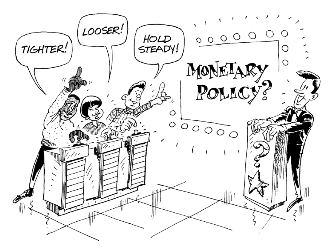
The opinions of professional analysts and others can vary regarding what the most appropriate monetary policy actions should be.

Some economists may question the Bank's decisions, since people may differ for many reasons in what they see as the most appropriate monetary policy decisions and actions. Why might there be differences of opinion?